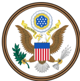
Fig. 1.1. The obverse side of the Seal of the United States

E pluribus unum is Latin for “Out of many, one”. This sentence is best known as one of three shown on the Seal of the United States, that was adopted by an Act of Congress in 1782. It appears on the obverse side of the seal, as well as on official documents and U.S. currency. Considered since long the unofficial motto of the United States (whereas the official motto since 1956 is “In God we trust”), it was originally conceived to represent the idea that a single nation would emerge out of many states.